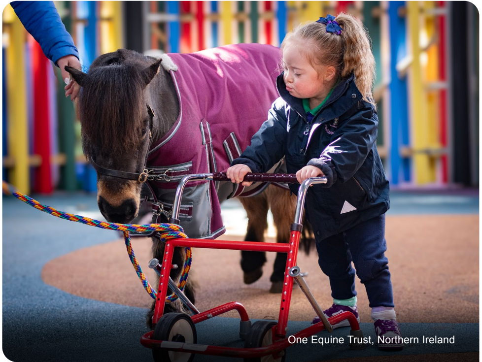
One Equine Trust, Northern Ireland