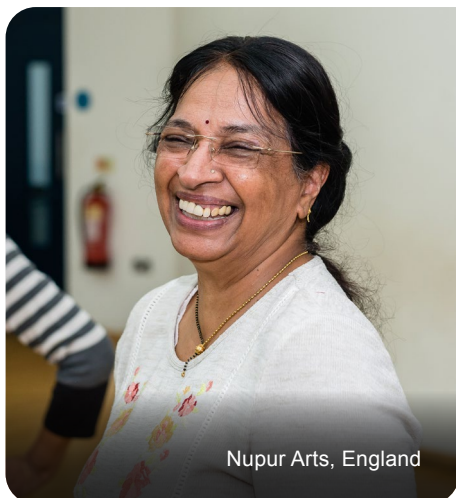
Nupur Arts, England

DCMS is committed to eliminating discrimination and advancing equality of opportunity in its public appointments. We particularly encourage applicants from underrepresented groups, those based outside London and the South-East and applicants who have achieved success through non-traditional educational routes. This ensures that boards of public bodies benefit from a full range of diverse perspectives and are representative of the people they serve. This will include championing opportunity all across the organisation, helping to ensure that the organisation is one in which a genuinely diverse range of views can be expressed, without fear or favour.