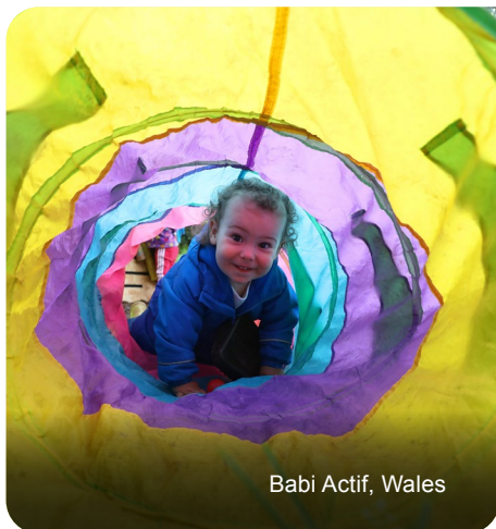
Babi Actif, Wales