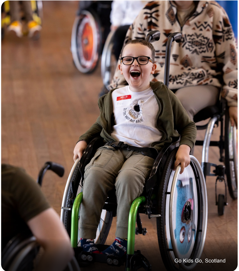
Go Kids Go, Scotland