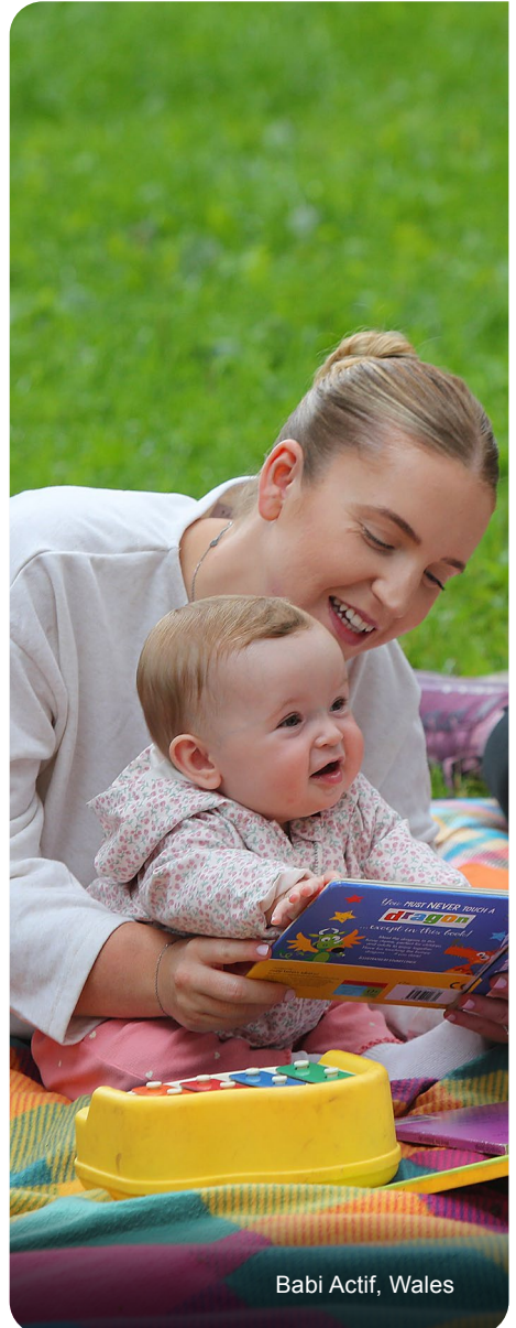
Babi Actif, Wales

We ask all applicants to complete a diversity monitoring form. We hope you will help us by providing this information.