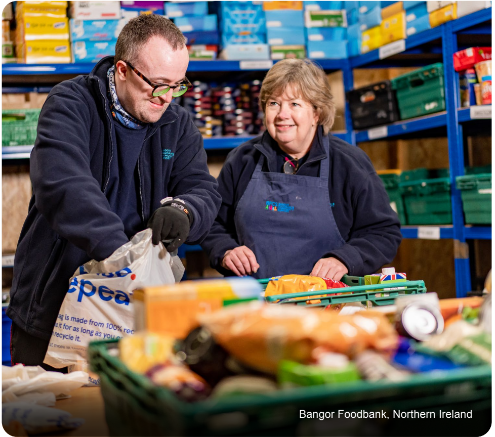
Bangor Foodbank, Northern Ireland