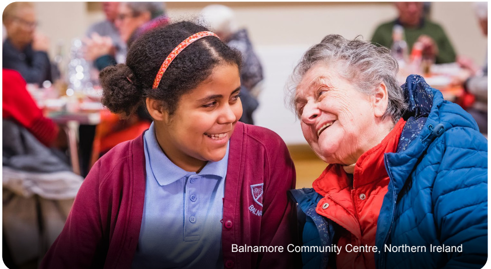
Balnamore Community Centre, Northern Ireland