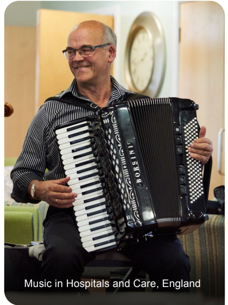
Music in Hospitals and Care, England

We are looking for someone with a demonstrable track record of policy influence or stewardship nationally or internationally who can provide challenge and support in our strategy It starts with community.