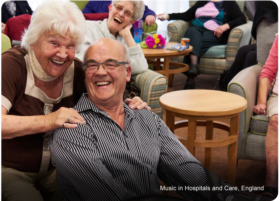
Music in Hospitals and Care, England

We try to guarantee an interview to anyone with a disability whose application meets the minimum criteria for the role. By minimum criteria, we mean that you must provide evidence in your application, which demonstrates that you meet the level of competence required under each of the essential criteria. If you wish to apply under this scheme, either state this in the covering email or letter when submitting your application or contact the team. This will in no way prejudice your application.