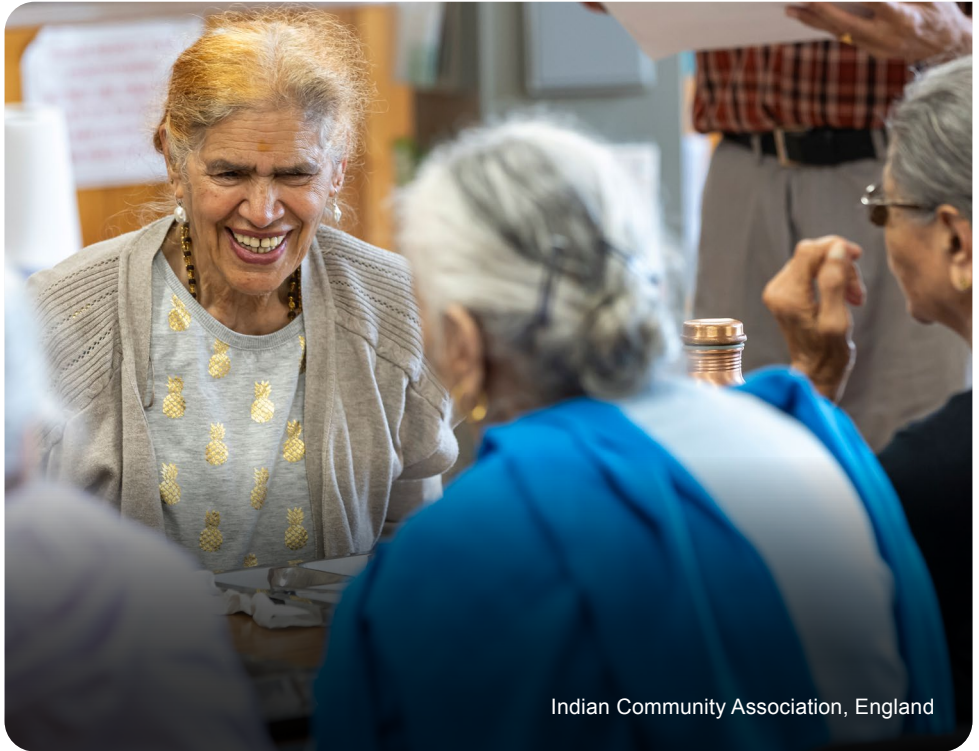
Indian Community Association, England