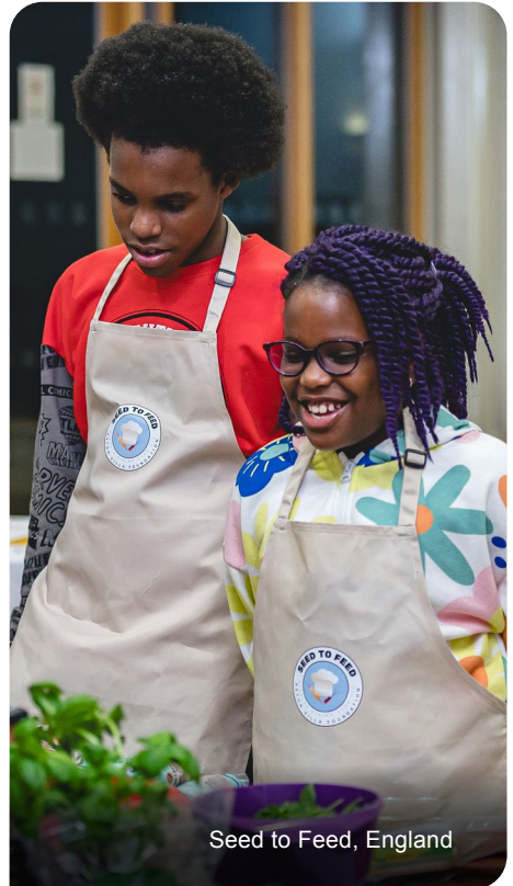
Seed to Feed, England