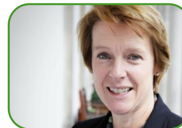
Dame Caroline Spelman Non-Executive Board Member