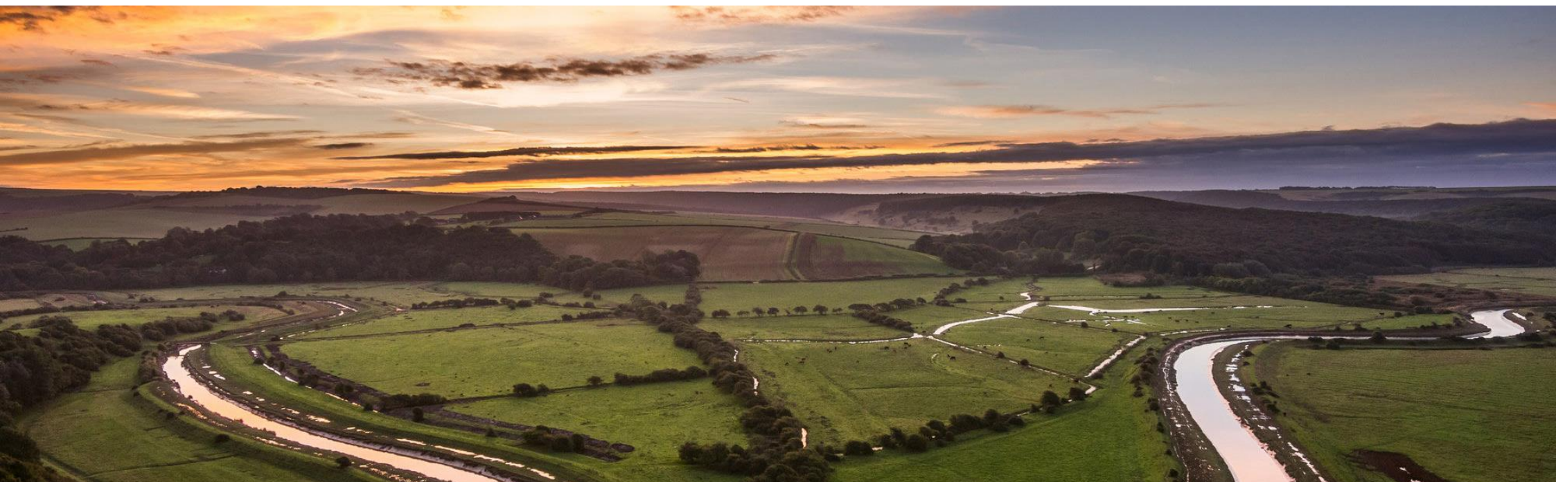
Image: South Downs National Park, Cuckmere Haven

If there is conflict between the purposes, Protected Landscapes organisations, with the exception of the Broads Authority, are required by statute to place greater weight to conserving and enhancing the natural beauty, wildlife and cultural heritage of the park, a concept known as the 'Sandford principle'.