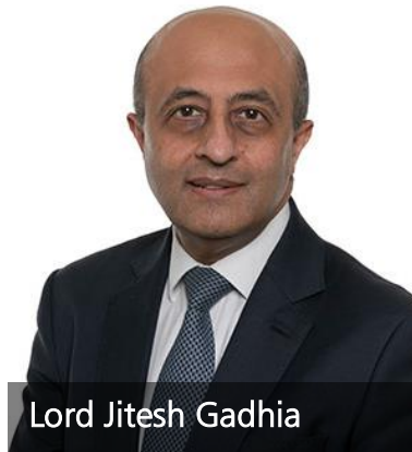
Lord Jitesh Gadhia