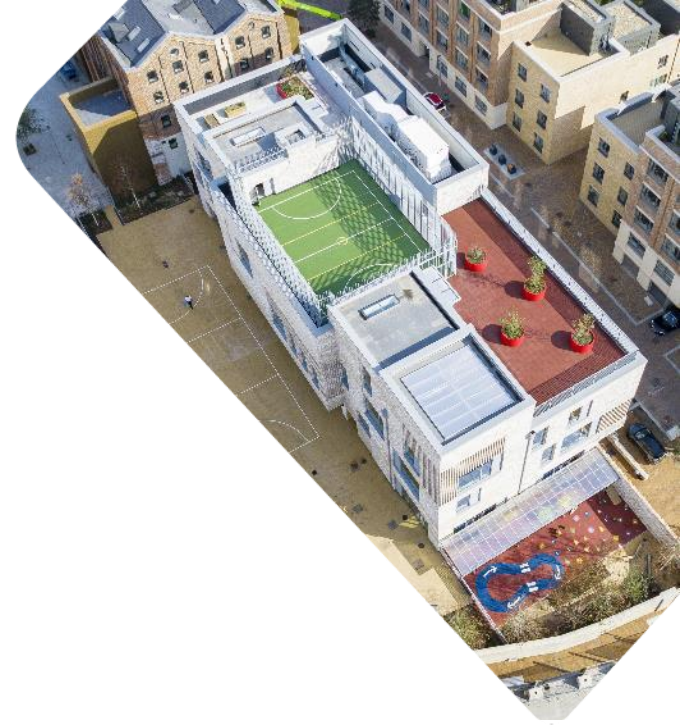
School 360 completed

Vision: Promoting and protecting LocatED's position, values, mission, integrity and reputation.